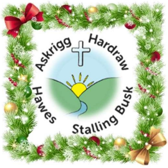
Edition Number 99

Tel: 01969 667553 Email: office@upperwenben.org www.upperwensleydalechurch.org