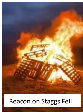
Beacon on Staggs Fell