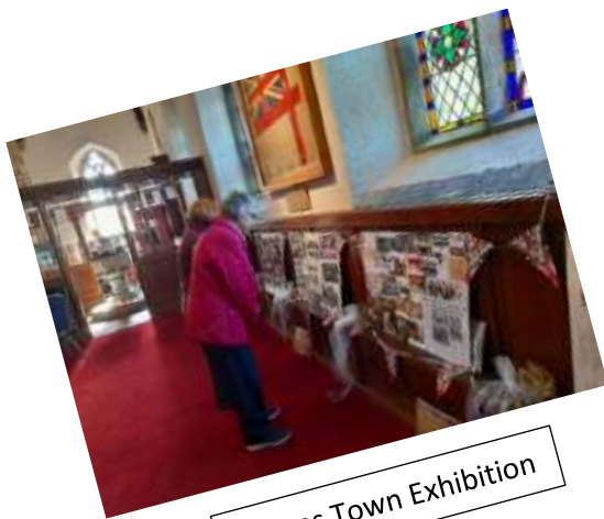
Hawes Town Exhibition