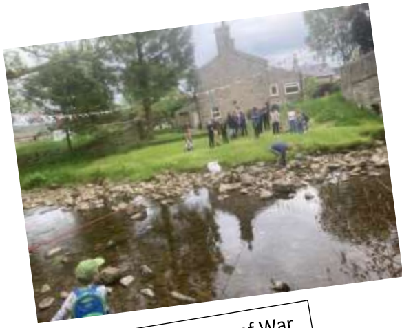
Hadraw Tug of War